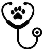
Health Check Exams