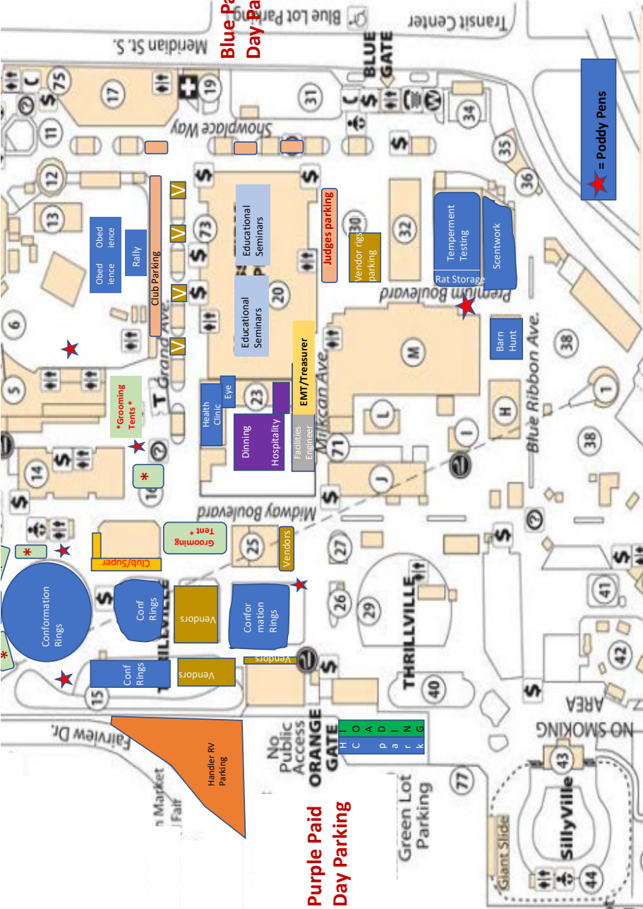
Map of the Show Site