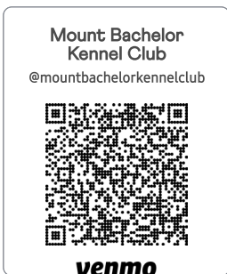
Scan this code to pay

Redmond Central Oregon KOA 2435 SW Jericho Lane Culver, OR 541-546-3046 (approximately 15 minutes South of Show site)