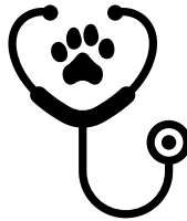
Health Check Exams